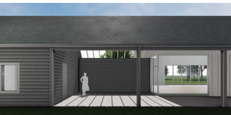
Covered entrances to the Dance Studio on the right and the Composers' Studio on the left.

Like you, MSF has had to choreograph new ways of working in 2020, sequestering ourselves and meeting on Zoom because of the Covid pandemic. But that hasn't kept us from making progress. It's been a great year!