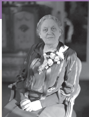
Carrie Chapman Catt